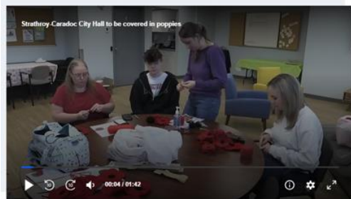
Volunteers have created thousands of poppies in anticipation of their unveiling in advance of Remembrance Day 2024. Sean Paine reports.

By Sean Paine Published March 06, 2024 at 6:00AM EST