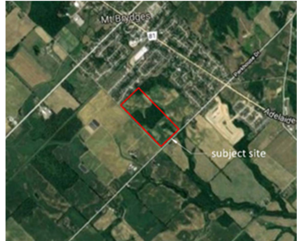
Figure 1 - Subject Site Location

The proposed subdivision plan is approximately 20.69 hectares (51 acres) and consists of 96 single family lots, 5 multi-family blocks, 1 park block, 8 open space blocks and a number of road widening and reserve blocks served by 4 new streets. This proposal shows reconfigurations of lots along Streets A to Street D to modify frontages, as well as the creation of three new multi-family blocks. A redline revised Draft Plan is being provided at the end of this report in Appendix A.