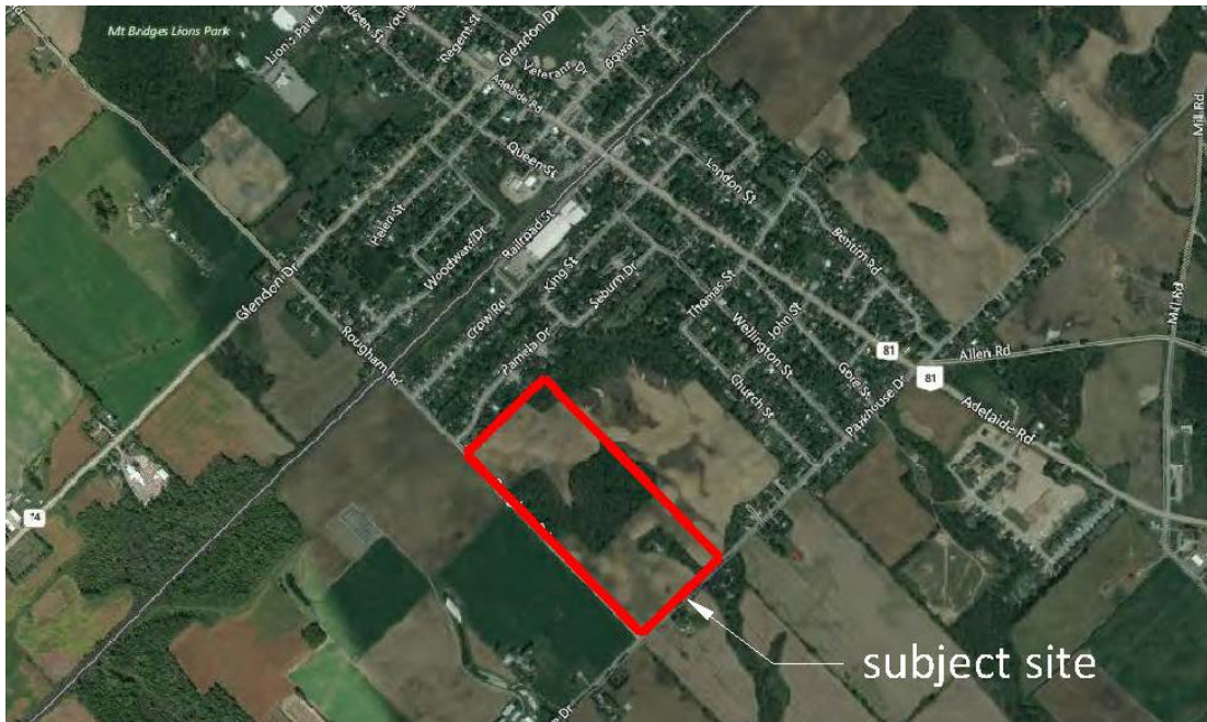
Figure 4 – Aerial Photo of Existing Context