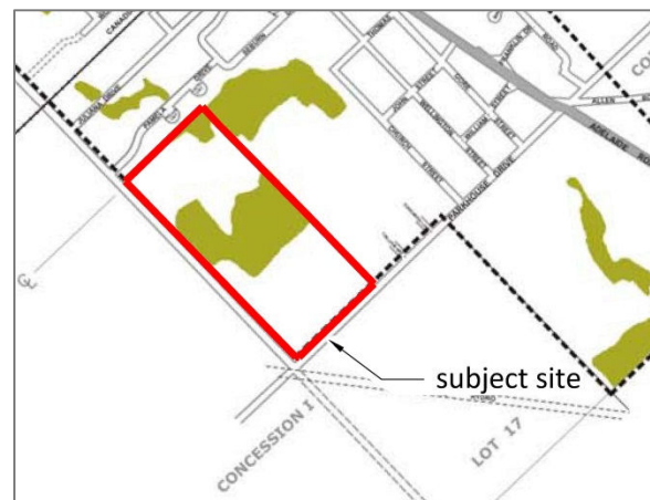
Figure 2 - Schedule G, Strathroy Caradoc Official Plan

Schedule 'G' – Natural Heritage Features of the Official Plan identifies a large 'Woodland' through the centre of the property, with a smaller area of woodland in the northeastern corner. Official Plan policies pertaining to woodlands indicate that they are intended to be protected and enhanced wherever possible, and maintained in their natural state. In addition, development proposed adjacent to a woodland (i.e. – within 50 metres) requires a Development Assessment Report (DAR) to demonstrate no negative impacts on the woodland or its ecological functions.