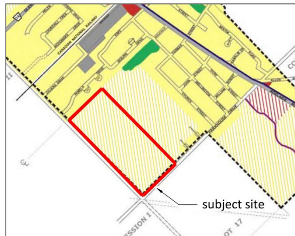
Figure 1 - Schedule F, Strathroy Caradoc Official Plan

Section 4.3.1.1 of the Official Plan states that the primary land use within areas designated Residential is intended to be single unit detached dwellings. Other dwelling types may also be permitted including accessory apartments, semi-detached dwellings, duplex dwellings, converted dwellings, townhouses and low rise, small scale apartment buildings. A range of dwelling types is encouraged to meet the diverse needs and preferences of existing and future residents as well as providing opportunities for more affordable housing.