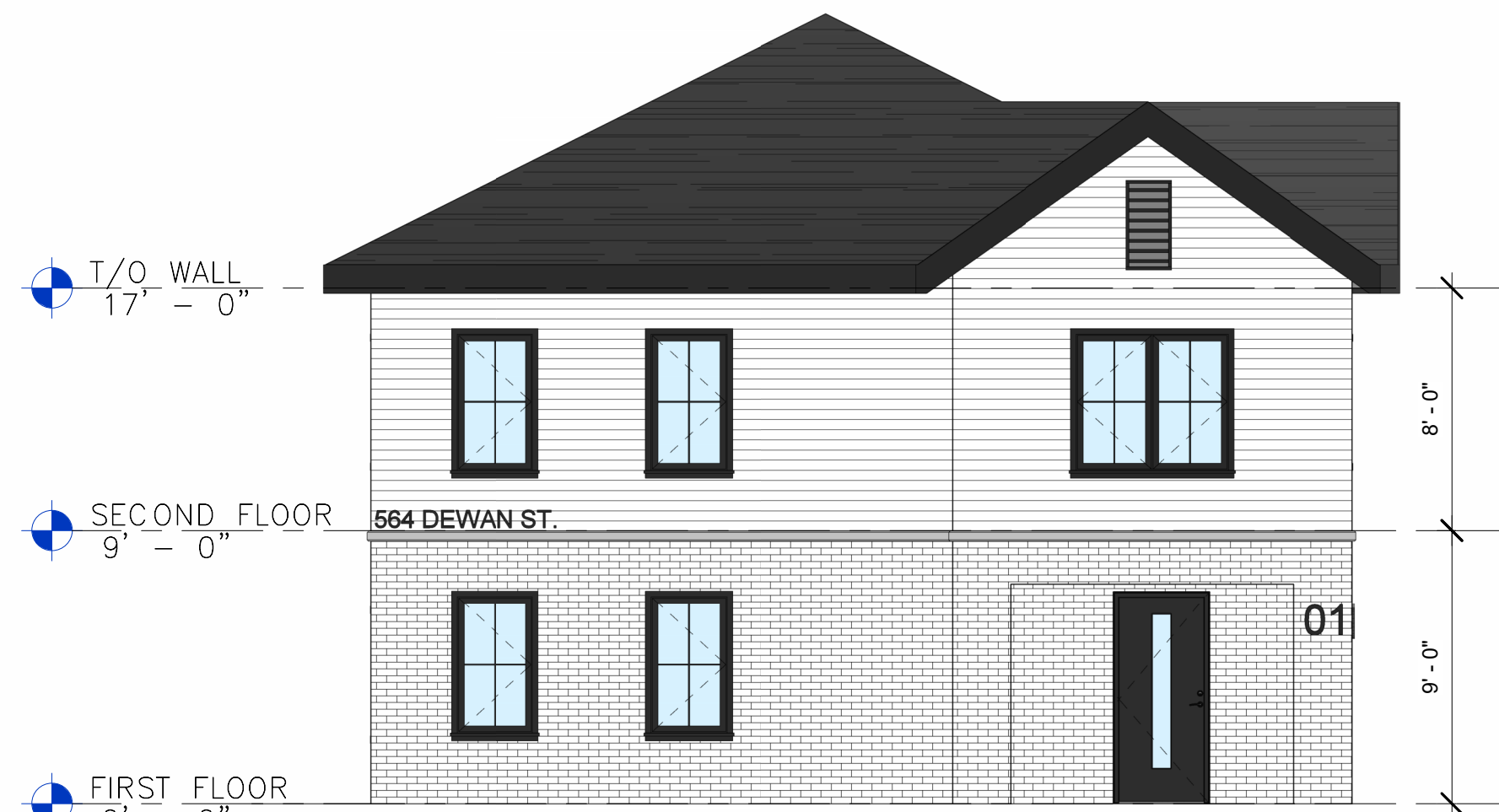
East Elevation SCALE = 3/16" = 1'-0"