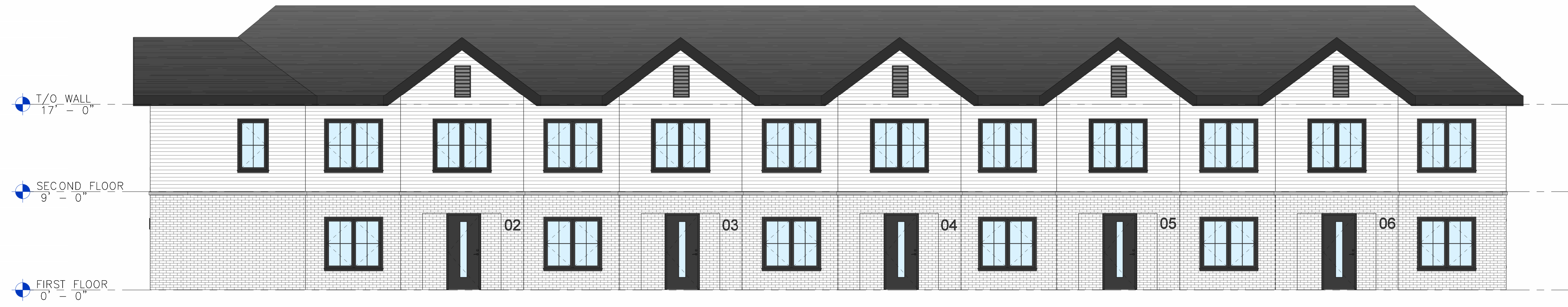
North Elevation SCALE = 3/16" = 1'-0"