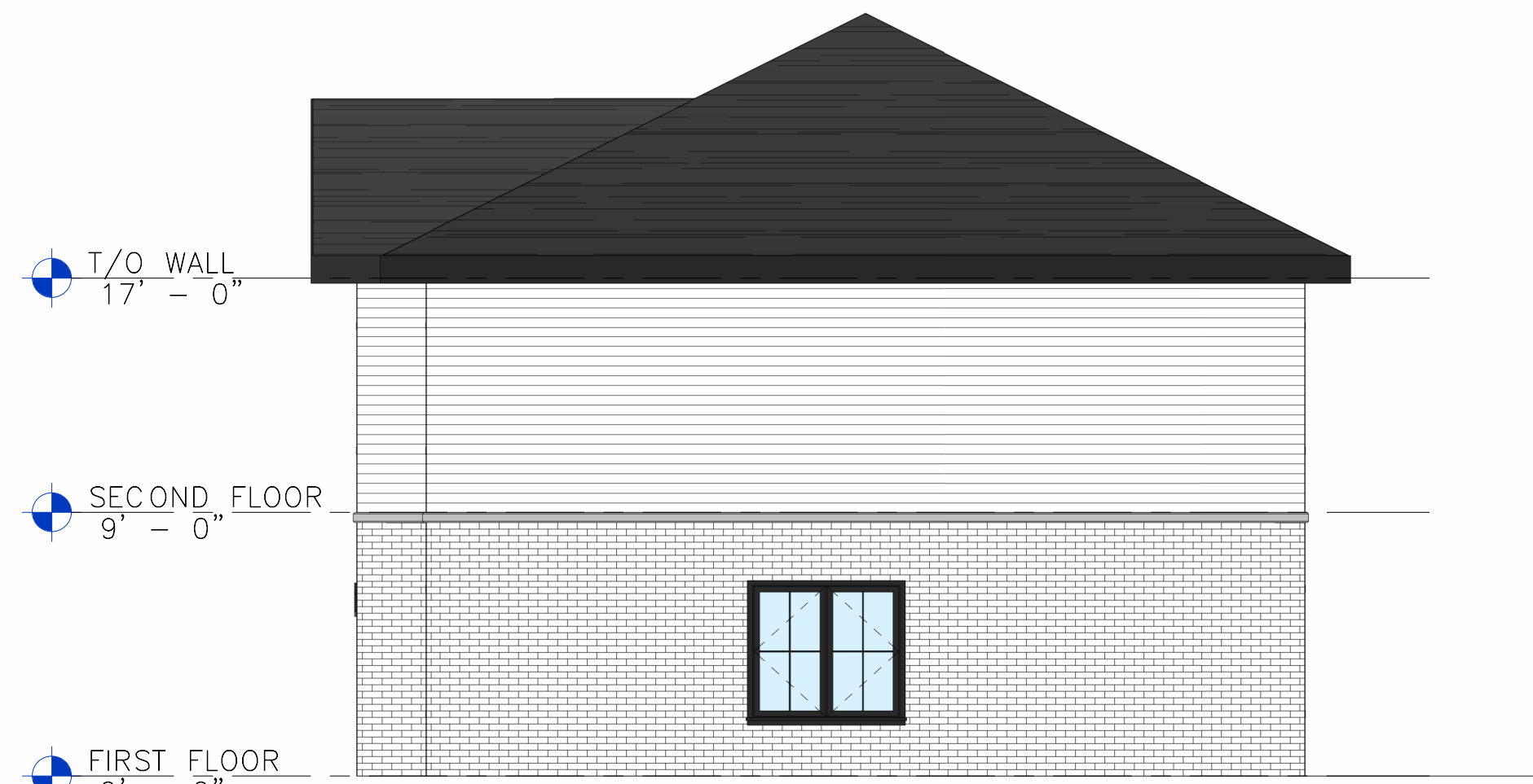
West Elevation SCALE = 3/16" = 1'-0"