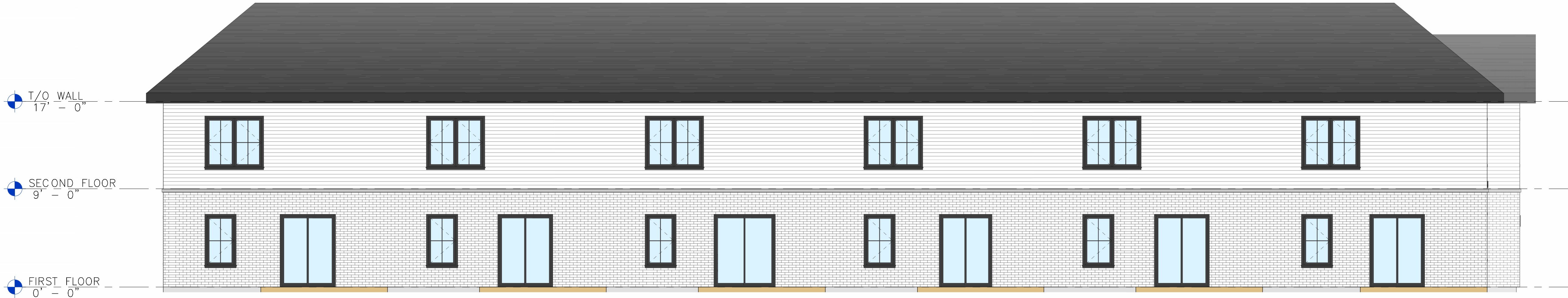
South Elevation SCALE = 3/16" = 1'-0"