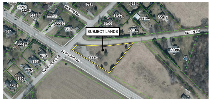
Subject Lands Location Map

On the day of the virtual open house, please log in before 6:00pm to ensure all participants are in attendance prior to presentation start.