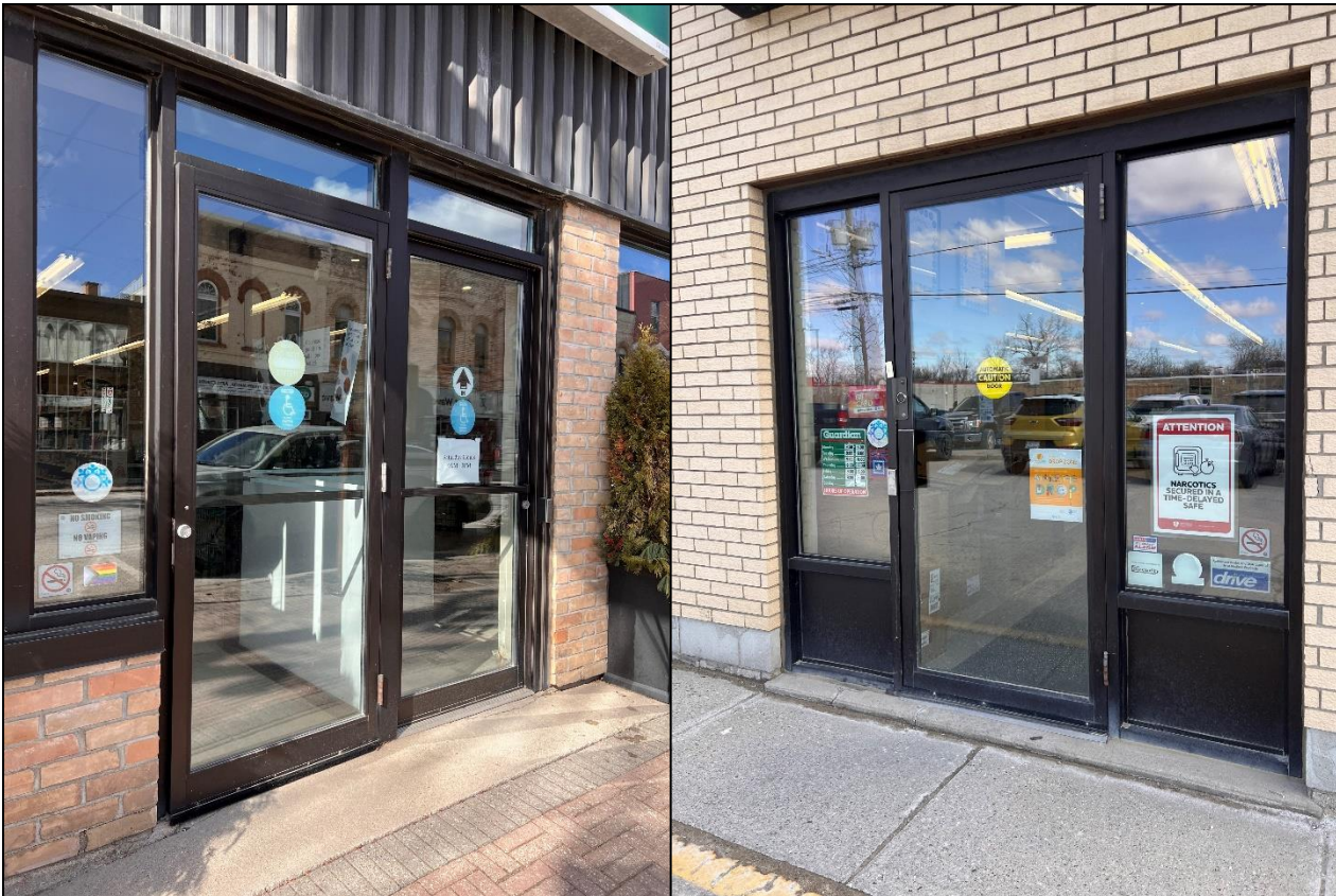
Figure 2. Current front entrance (left) and current rear entrance (right) of 35 Front Street W, Strathroy

The applicants came forward with a CIP application to replace the existing front and rear doors (Figure 2) with new accessible doors. The applicants wish to improve accessibility into their business which is currently not easily accessed by those with disabilities. The applicants applied for the Intensification and Redevelopment Program under the Construction Costs Matching Grant and Professional Fees Matching Grant to offset the costs of the new accessible entryway doors. The applicants have advised that work is expected to begin early May 2024.