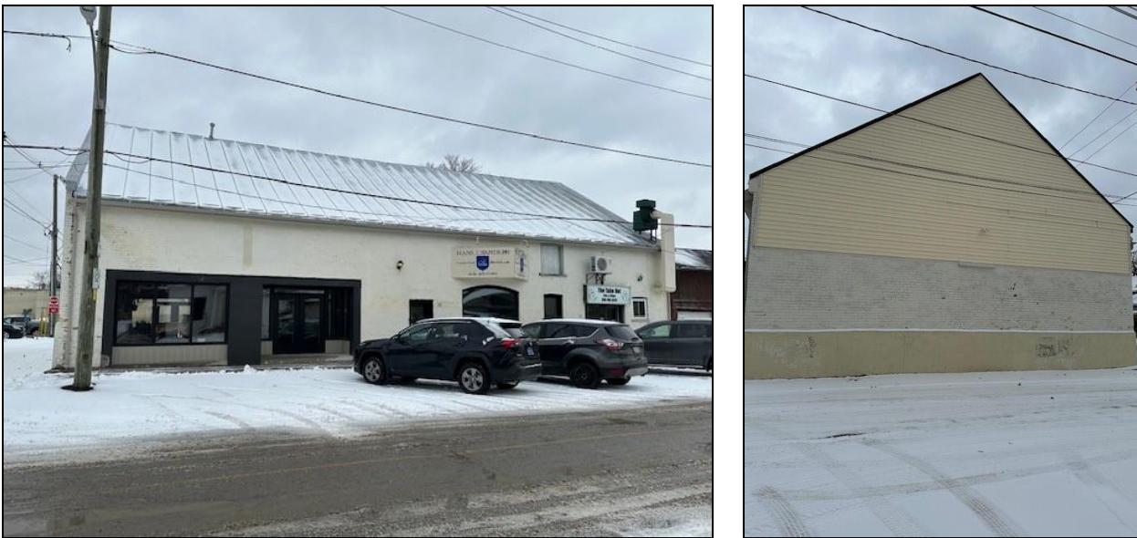
Figure 3. Current front of 79 Thomas Street, Strathroy (left) and the end of the building (right).

The applicants came forward with a CIP Application for the removal of paint and brick repointing of the front and side of the historical building (Figure 3). In recent years some of the exterior brick has been crumbling and requiring repairs to preserve the historical building. Their CIP application consists of repairs on two public-facing sides of the building therefore the application would be eligible for the multiple façade funding stream within the Construction Costs Matching Grant. In consultation with the building department, it was determined that a building permit is not required for minor brick repairs. The applicant has advised the work is planned to begin early spring 2024.