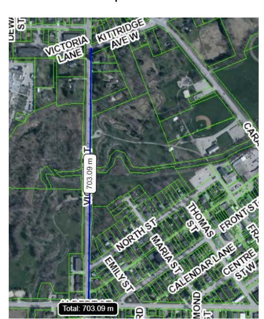
Distance of Proposed New Sidewalk

The RTMP identifies Victoria St. as having an Urban Multi-Use Trail (UMUT) as an alternative to sidewalk infrastructure. Staff appreciate the desire for this; however, to accomplish this UMUT the estimated cost would exceed $500,000.00 for just this section of trail. A sidewalk can be an alternative to the UMUT, provide continued access to the trail within Alexandra Park, and is significantly less expensive. The sidewalk would extend for approximately 700m from Kittridge St. to Albert St. (see image below)