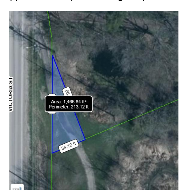
Approximate square footage of purchase

The landowner is prepared to sell the land to the Municipality provided the Municipality pays for legal fees, survey and erects a fence.