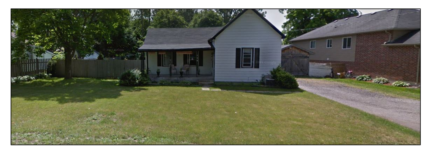
Figure 2 View of Subject Lands from Darcy Drive

The subject lands have an approximate area and frontage of approximately 1203.8m<sup>2</sup> (0.3ac) and 29.9m (98.3ft) respectively.