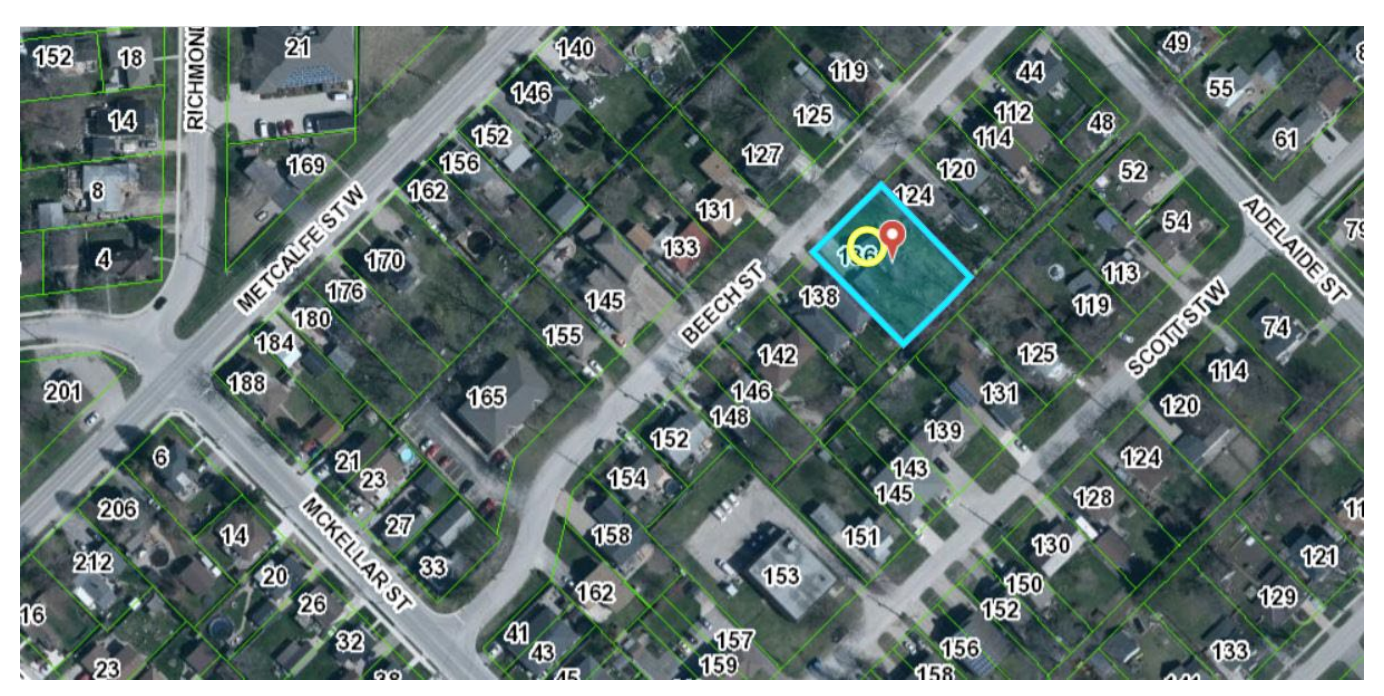
Figure 1 Subject Lands and Surrounding Land Uses

The purpose of the following land use Planning Justification Report is to evaluate a proposed Zoning By-Law Amendment (ZBA) within the context of existing land use policies and regulations, including the Provincial Policy Statement, the Middlesex County Official Plan, Strathroy Caradoc Official Plan, and the Strathroy Caradoc Zoning By-law.